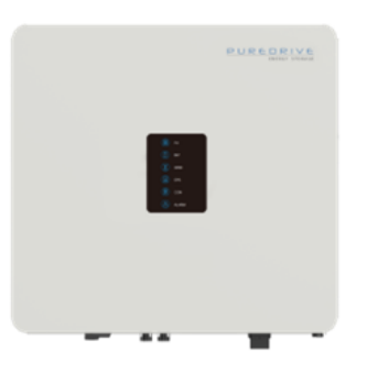
Puredrive Hybrid Inverter