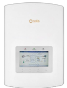
Solis Hybrid Inverter