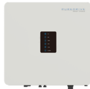
Puredrive Hybrid Inverter